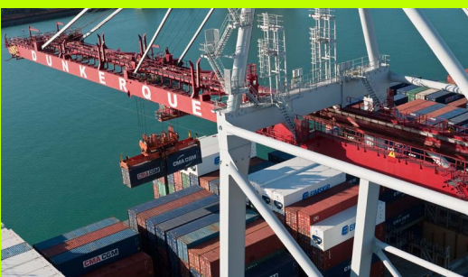
Loading containers from the Flanders terminal.

FROM 10 JUNE 2012, THE DATE OF THE INAUGURAL CALL AT DUNKIRK, THE MARITIME TRANSPORT GROUP CMA CGM WILL INCLUDE DUNKIRK (AFTER ANTWERP AND BEFORE LE HAVRE) IN THE ROTATIONS OF ITS EPIC (EUROPE PAKISTAN INDIA CONSORTIUM) SERVICE.