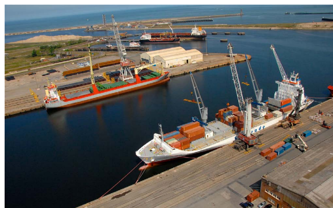
In Dock 6 (Eastern Port), handling operations on two general cargo ships.

2012 and was up 50% at 1.86MT. Grain traffic in March was good although it did not reach the exceptional export volume of 328KT recorded for the month of March 2011 alone. It posted a drop of 53% (289KT) compared with the same period in 2011. Volumes of «small» bulks were down by 20%. Solid bulks were generally stable at 5.46MT. General cargoes were up 19% at 4.50MT. RoRo traffic continued to grow with an increase of +33% to 3.58MT. Freight vehicles were up 36% with 159,000 trucks and trailers, and tourist traffic totalled 502,000 drivers and passengers (+31%). With 67,500 TEU, containers showed a small drop of 4% compared with 2011 which included some exceptional calls ■