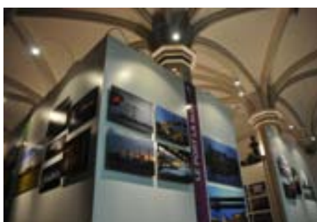
The exhibition «Arrêt sur Images» is on display in the Salle des Pas des Perdus of Mons City Hall.

From 21 June to 27 July 2012 an itinerant photo exhibition dedicated to the Port of Dunkirk will be on display in Mons Town Hall in Belgium. This is a joint event with PACO (Centre and West Port Authority) and the City of Mons.