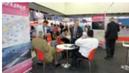
Dunkerque-Port's stand at the Transport Logistic China Fair in Shanghai.

Alongside this event Dunkerque-Port held a cocktail party in Shanghai city's «Shipping» area, attended by Chinese clients and French partners based in Shanghai. Several meetings were arranged, principally by Dunkerque-